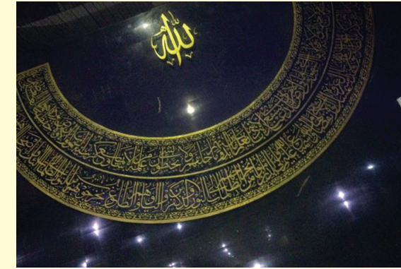
Interior of the mosque

The interior of the monument features a stunning number of relieved walls and pillars. There is also a marble staircase and floor from China, stained glass windows from Belgium, carefully decorated wooden doors and ornate bronze chandeliers. The stones were brought from Netherlands.