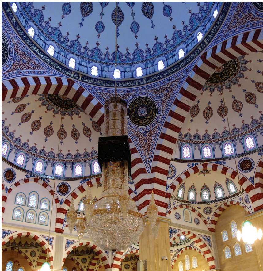
Interior of the Akhmad Kadyrov Mosque

“The Heart of Chechnya” or Akhmad Kadyrov Mosque is one of the largest mosques in Russia and is located in Grozny, the capital of Chechnya. The mosque was named after Akhmad Kadyrov, the first president of the Republic of Chechnya.